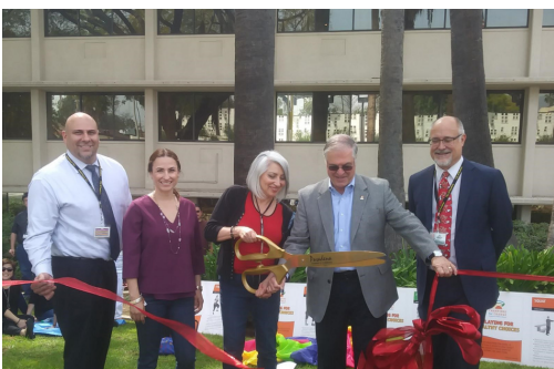
Mayor Terry Tornek helped cut the ribbon to celebrate a rebranding campaign of the Pasadeana Public health Department.