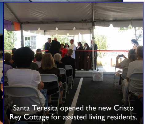
Santa Teresita opened the new Cristo Rey Cottage for assisted living residents.