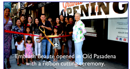
Emblush Beauté opened in Old Pasadena with a ribbon cutting ceremony.