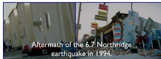
Aftermath of the 6.7 Northridge earthquake in 1994.

Pasadena Chamber member Optimum Seismic sponsors a free workshop for commercial property owners. Learn the basics of earthquake safety and the importance of appropriate and adequate retrofitting. New laws related to commercial retrofits will also be explained. Presenters include Caltech seismologists, earthquake retrofit professionals, first responders, preparedness and recovery experts.