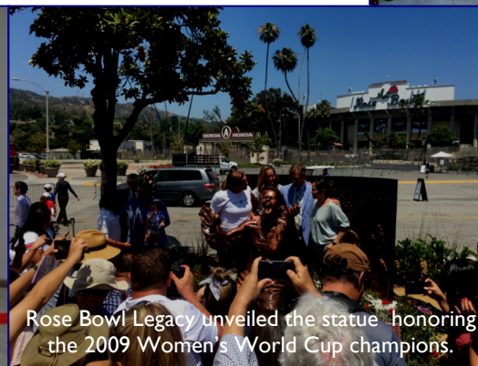
Rose Bowl Legacy unveiled the statue honoring the 2009 Women's World Cup champions.