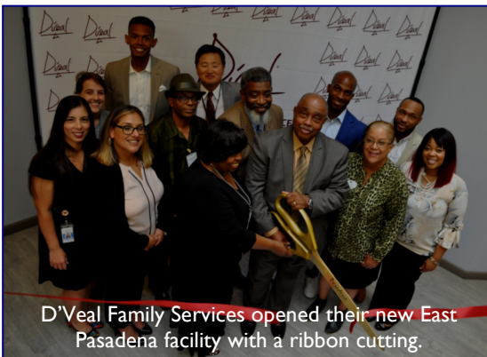
D'Veal Family Services opened their new East Pasadena facility with a ribbon cutting.