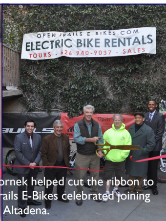
Crackin' Kitchen opened in Old Pasadena. Mayor Terry Tornek helped cut the ribbon to unveil the new entry and bistro at Villa Gardens. Open Trails E-Bikes celebrated joining the Chamber with a ribbon cutting in Altadena.