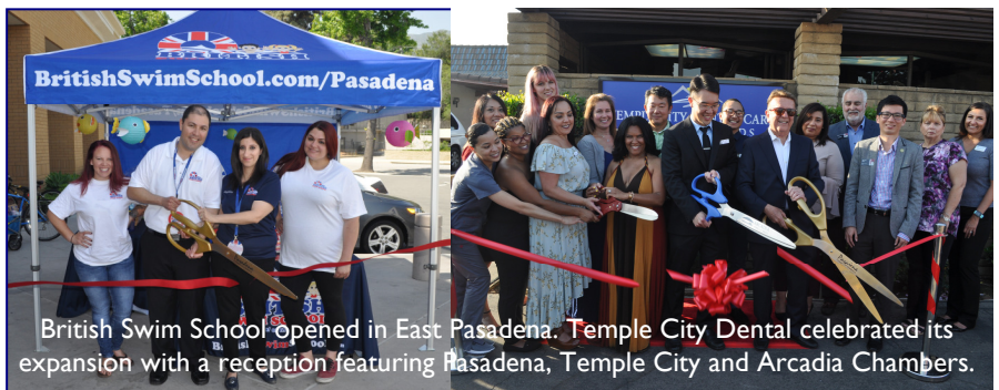
British Swim School opened in East Pasadena. Temple City Dental celebrated its expansion with a reception featuring Pasadena, Temple City and Arcadia Chambers.