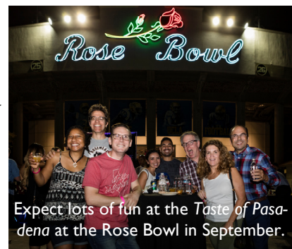
Expect lots of fun at the Taste of Pasadena at the Rose Bowl in September.

Tickets to the Taste of Pasadena are available online at www.pasadena-chamber.org and through EventBrite and Goldstar.