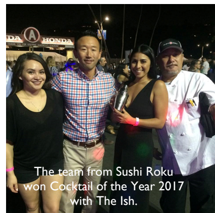
The team from Sushi Roku won Cocktail of the Year 2017 with The Ish.

Voting for SIP-tember kicks off on August 1, 2018. A complete list of venues offering cocktails for the 2018 SIP-tember Cocktail Bracket Challenge will be announced in July. Information is posted at pasadenarestaurantweek.com as it becomes available.